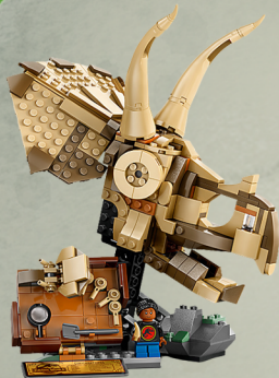
LEGO JURASSIC WORLD TRICERATOPS SKULL