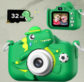
DINOSAUR KIDS CAMERA

OR CHOOSE A $100 GIFT CARD FOR AN EXPERIENCE!